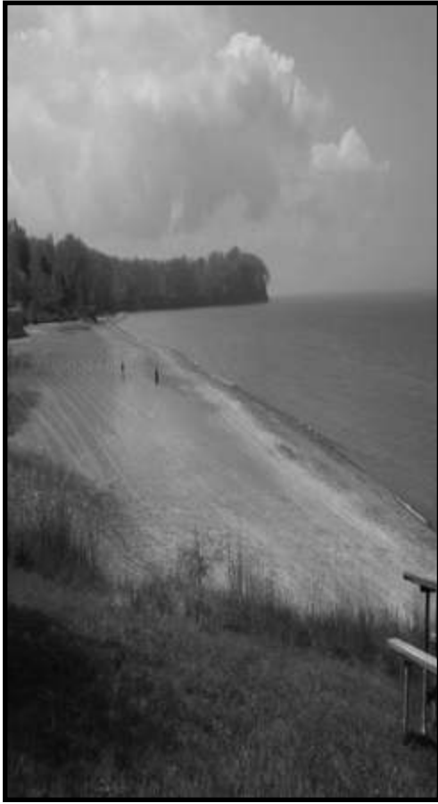
Irving, New York